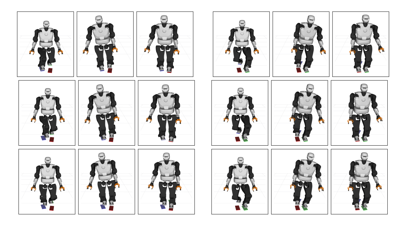
Fig. 2. Examples of predicting single-step motions. Warm-start produced by Top: GPR, Middle: GMR, and Bottom: k-NN. Left: left foot movement. Right: right foot movement. The green, blue and red box correspond to the initial left, the initial right, and the goal contact pose, respectively.

q. We do not predict the trajectory of the control input here, but instead calculate it from q assuming quasi-static movement. This computed control input trajectory is denoted as u_0 . The initial guess is used to warm-start Crocoddyl, and the result is compared against the cold-start. We also compare the effect of using Database Hpp and Crl. We use a large convergence threshold (10^{-2}) for Crocoddyl here, based on the assumption that at online computation a very refined optimal motion is not really necessary. The number of iterations is also limited to 20. The query time is ~5ms for GPR and ~10ms for GMR in python implementation.